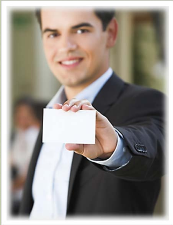
Inspectors Will Show You Their CDTFA Identification